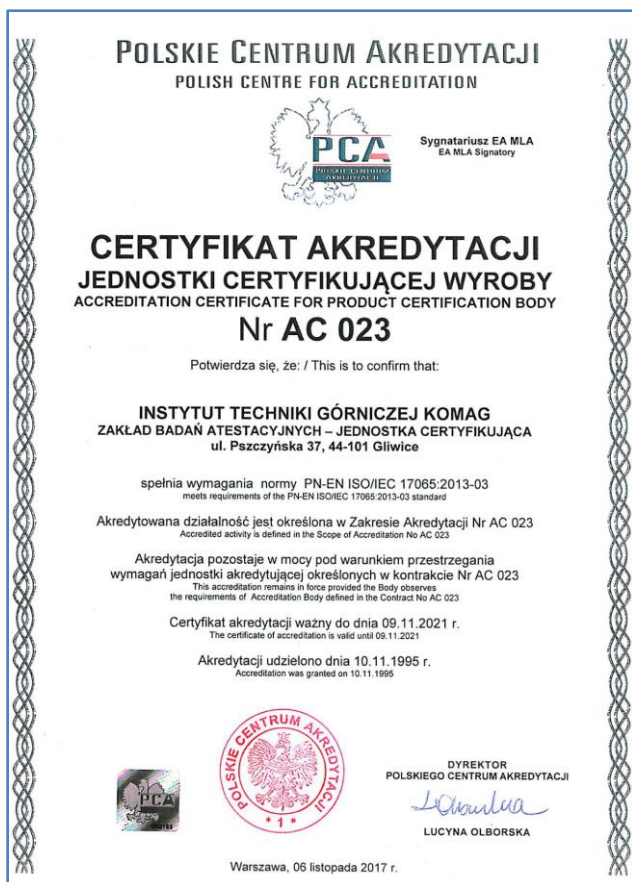
Fig. 2 Accreditation Certificate for the Division of Attestation Tests, Certifying Body

The accreditation guarantees reliable, competent, independent and impartial assessment of products with the requirements of reference documents (standards, normative documents, technical specifications) carried out by a certifying body. The condition for obtaining accreditation is meeting the requirements concerning, among others, the organisational structure, resources (personnel, testing capabilities) and management system contained in the PN-EN ISO/IEC 17065:2013-03 Standard [7] and accreditation requirements of the Polish Centre for Accreditation. The Division of Attestation Tests, Certifying Body fulfils all the accreditation requirements, which is confirmed by the accreditation certificate (Fig. 2).