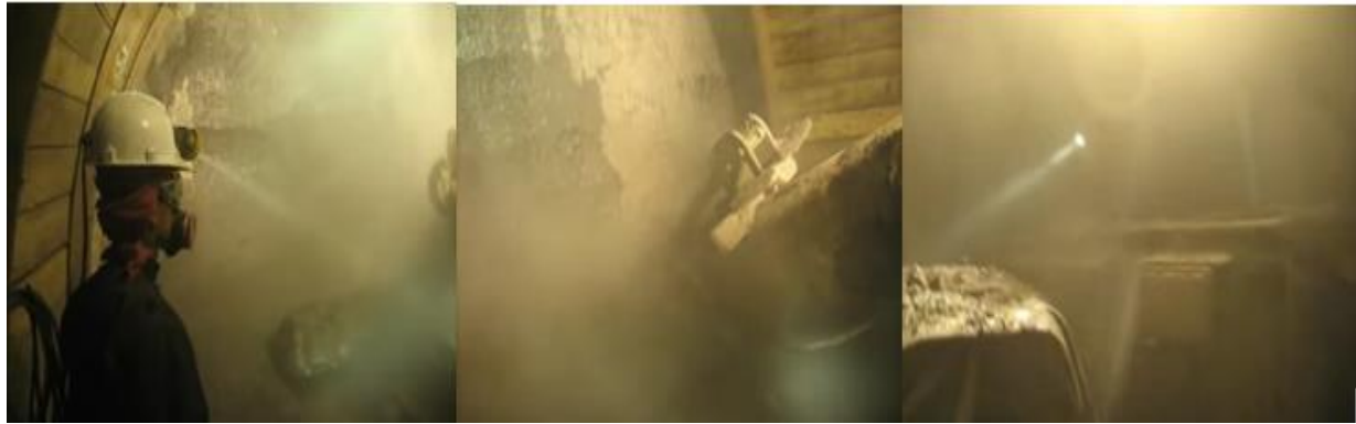
Fig. 1. Face GRP-2 of X mine

Employees of the preparatory department were employed in a three-shift system according to the work schedule presented in Table 1, in six mine workings, to which the following letter designations were assigned: A – slope 3 (face); B – roadway 4, C – roadway 7, D – roadway 11 (working connected with transport of the run-of-mine from the face to the central main); E - slipway 12, F - loading ditch (transport working), and at six workstations: shearer operator - 1, shearer operator assistant - 2, miner - builder - 3, miner in transport - 4, conveyor operator - 5, miner in the face - 6, shot miner - 7, driller - 8.