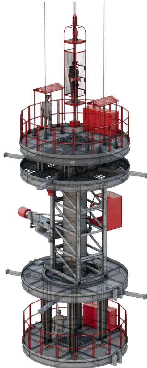
Fig. 2. A view of the shaft reaming machine

The key structure of the reaming section is the frame to which both the cutting head boom and operator's cabin are assembled. A gear rack allows for a vertical movement of the cutting head, while the bearing connecting the truss construction with the top platform and the tubular guide is responsible for a rotational movement of the whole construction and thus of the cutting head [17].