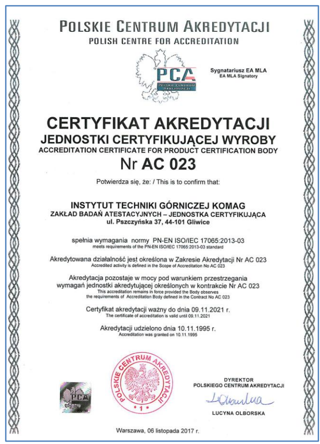
Fig. 2 Accreditation Certificate for the Division of Attestation Tests, Certifying Body

The accreditation guarantees reliable, competent, independent and impartial assessment of products with the requirements of reference documents (standards, normative documents, technical specifications) carried out by a certifying body. The condition for obtaining accreditation is meeting the requirements concerning, among others, the organisational structure, resources (personnel, testing capabilities) and management system contained in the PN-EN ISO/IEC 17065:2013-03 Standard [7] and accreditation requirements of the Polish Centre for Accreditation. The Division of Attestation Tests, Certifying Body fulfils all the accreditation requirements, which is confirmed by the accreditation certificate (Fig. 2).