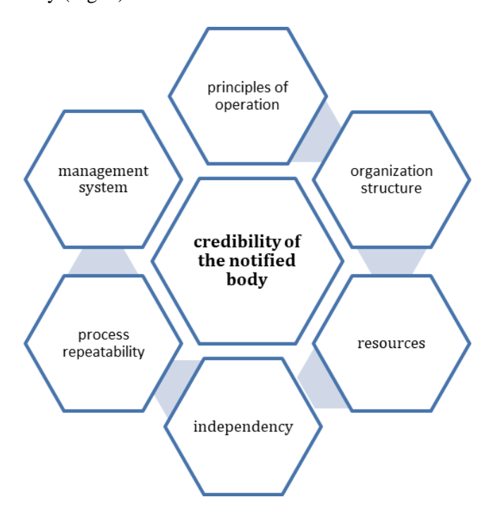
Fig. 2. Factors having an impact on credibility of the notified body [22]

Analyzing both contexts; external and internal context, the notified body must prove meeting a series of requirements having an impact on its credibility, i.e. among others competences or impartiality of its activity (Fig. 2).